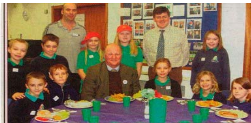
MP James Paice with pupils and staff at St Mary's Junior School

A primary school in Ely has come up with a way of encouraging good behaviour among its pupils.