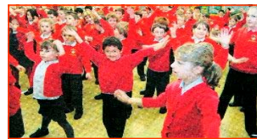
Lt. Thetford Pupils Wake and Shaking

Now the school is hoping to be awarded Healthy School status by the end of the year—a national government initiative aimed at promoting wellbeing in school and home.