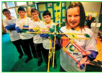
Pupils from St Martin at Shouldham Primary School with their energy display

For the last 2 years 140 pupils from across Norfolk have been taking part in an “energy busting” project which helped them to cut carbon emissions by 40% in their schools through a range of lifestyle changes.