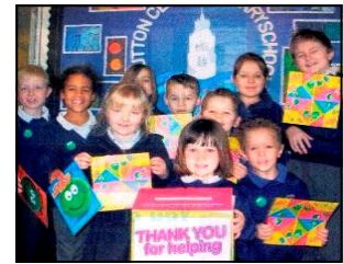
Pupils who took part in the maths challenge

Youngsters at Sutton Primary School raised the money for the National Society for the Prevention of Cruelty to Children (NSPCC) by getting sponsored to complete a series of increasingly difficult tricky sums and problems.