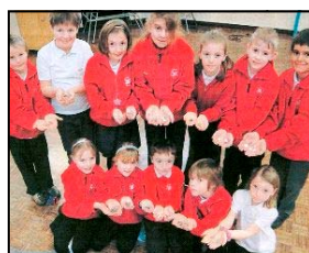
St Andrew’s pupils bring in their spare change to create a river of silver

Upper and Lower pupils brought in their spare change to create a ‘river of silver’ to donate to a representative from the Wildlife Trust.