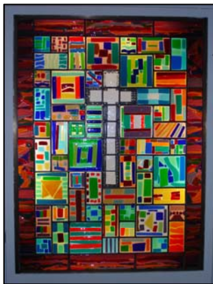
Ely St Mary's School Entrance Hall Window

The Stained Glass Museum has just completed a project with St Mary's primary school, Ely, which has resulted in this wonderful window for their entrance hall.