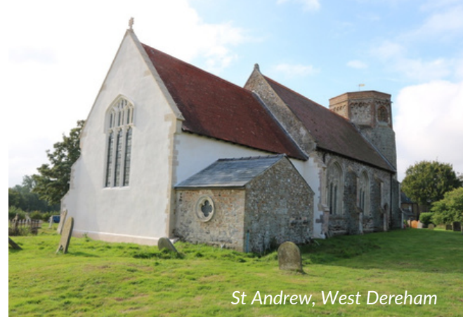
St Andrew, West Dereham

The walls of St Andrew's Church were, like many churches, suffering in places due in part to the use of cement. As a result of the deteriorating clunch the east chancel window had to be replaced. To prevent further problems it was decided to re-render and limewash the chancel walls. There was evidence that lime render had originally been used. New rainwater goods and drainage were also installed. Explore the church .