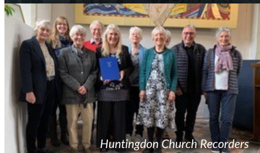
Huntingdon Church Recorders