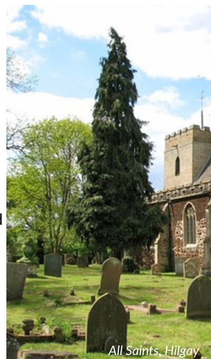
All Saints, Hilgay

Works carried out by local authorities in churchyards will still require the relevant diocesan consent.