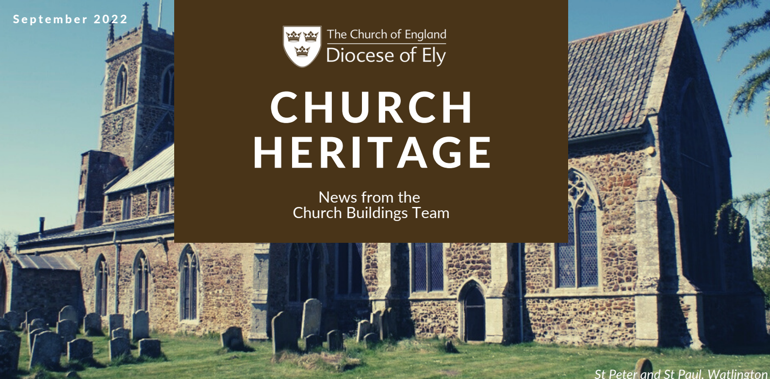
St Peter and St Paul, Watlington