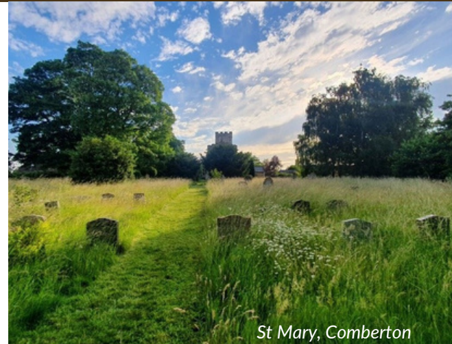
St Mary, Comberton

Since 2020, a steering group at St Mary's Church, Comberton have been working to create a haven for wildlife in their churchyard. This year, their first steps were rewarded with a Silver Award in the Wildlife Trust's Churchyard Conservation Scheme. Find out more about the scheme in Cambridgeshire and Norfolk .