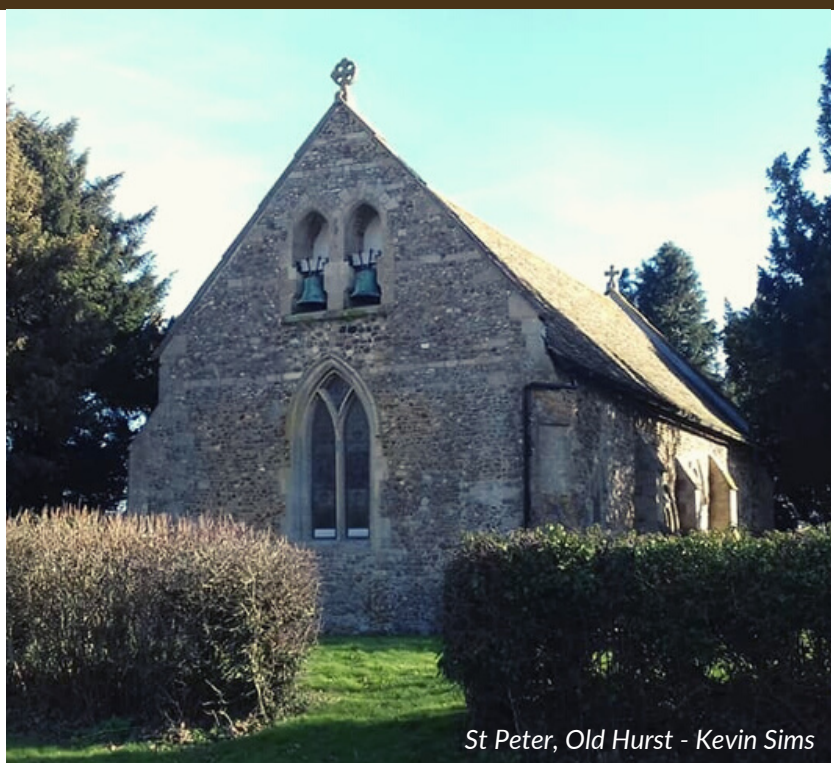
St Peter, Old Hurst