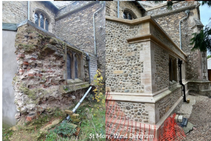
St Mary, West Dereham

Since 2016, St Mary's PCC has completed a number of building projects, the most recent being repairs to the exterior wall of the vestry. The difference is striking. Find out more on the website .