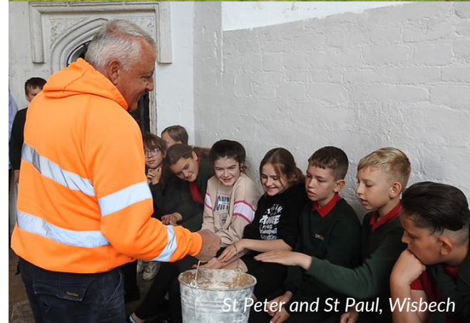
St Peter and St Paul, Wisbech

The major project of repairs and heritage activities at St Peter and St Paul Church is nearing completion. Many of the activities have grown from strength to strength, including the schools project, which offered a heritage careers day for pupils in June. Read about the activities , from stone carving to bellringing, and how your church could work with a local school.